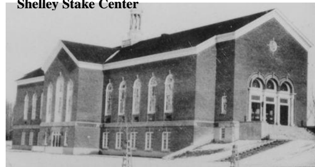
Shelley Stake Center